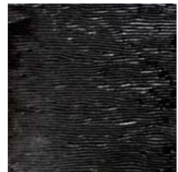
1009CSF Black Cord