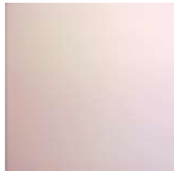
291-61S and 291-61SF Pink Champagne