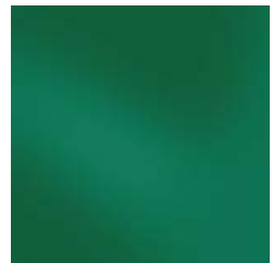
220-76S and 220-76SF Dark Green