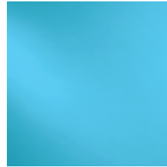
233-74SF Turquoise Blue