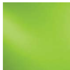
226-74SF Amazon Green