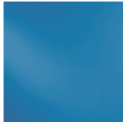
233-75SF Mariner Blue