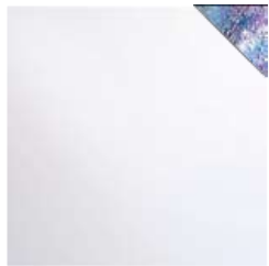
200S, 209SF, I/200S, I/200SF White