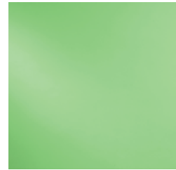
222-72SF Pastel Green