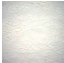
209K Crystal Opal Krinkle