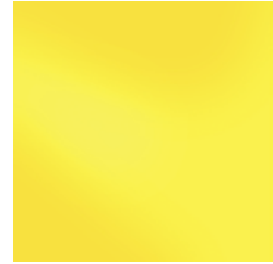
260-72S and 260-72SF Yellow