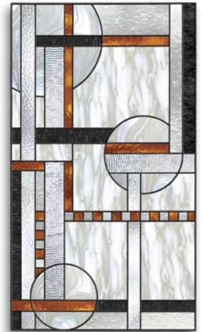
Design by Suzan Vrba-Stacy

The flip side of the insert offers a striking Geometric Abstract pattern, by Suzan Vrba-Stacy. Monterrey Spirit™ was a natural choice for this project with its lively, directional flecks of color reminiscent of antique hand-blown glass. The Spirit selection provided an intriguing sense of movement which, because of its neutral color, could still be used in large areas without overpowering the piece. Once we decided on the direction and placement of the Spirit sections, we complemented these with areas of color & texture to give the piece visual tension, or "pop."