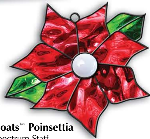
SilverCoats™ Poinsettia Spectrum Staff