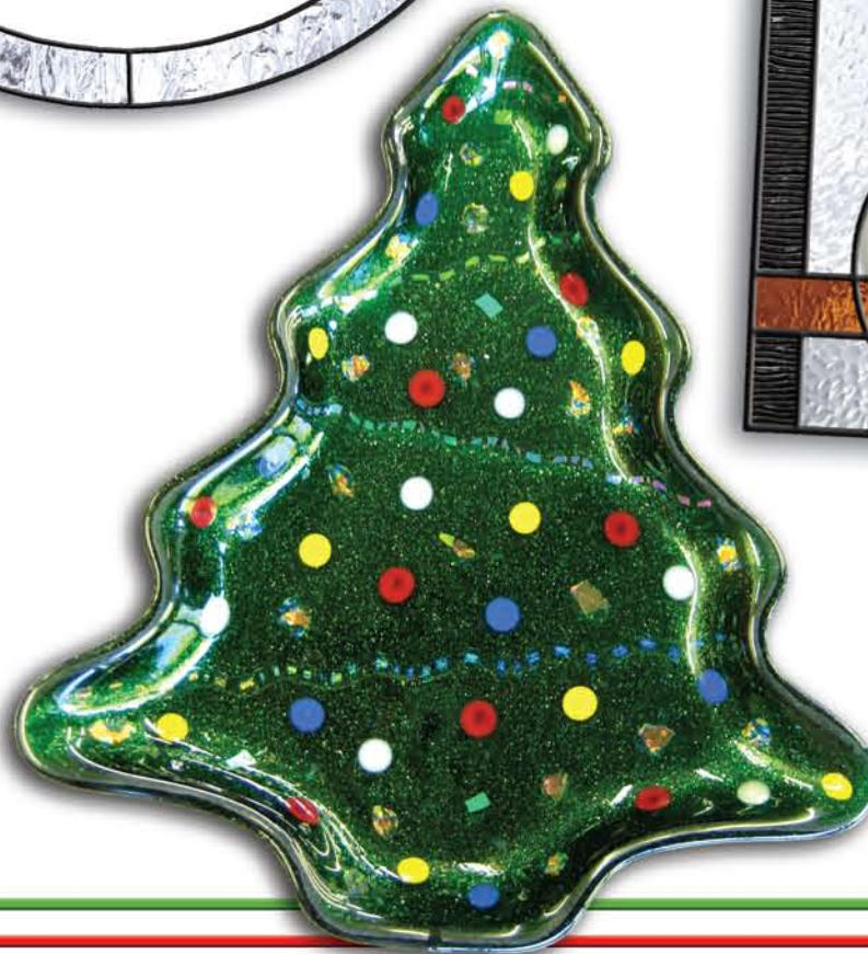
Holiday Tree System 96® Project Guide