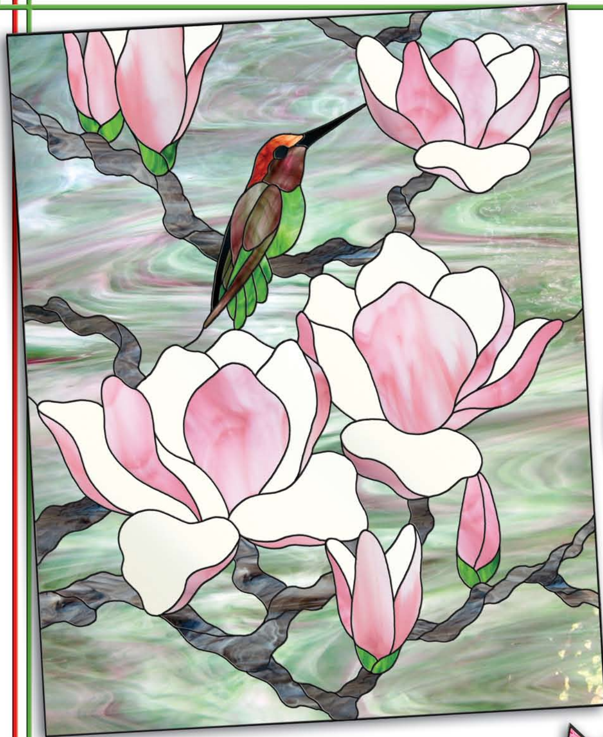
Springtime Magnolia From the book "Classic Images" Terra