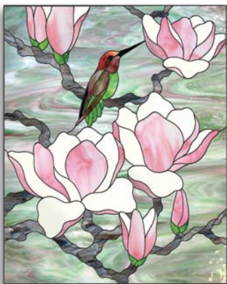
Design by Terra Parma

Tips & Tricks: Selecting just the right section of glass can elevate the look of a piece. For instance, you can further the sense of realism in the Magnolia petals by choosing darker Pink areas of glass for the underside of petals to simulate shadow. Running the deepest color from the base of a bud or leaf to the outer edge will add depth, dimension, and a far more natural sense of light. The direction of the "grain" in the glass is also important. Always keep the grain flowing consistently, avoiding sudden changes from vertical to horizontal. Leaves and petals look more realistic with the grain running from the base to tip. A background such as in the Magnolia piece is best cut from a solid piece so the stir in the glass flows naturally and quietly, allowing the main elements to be the primary focus.