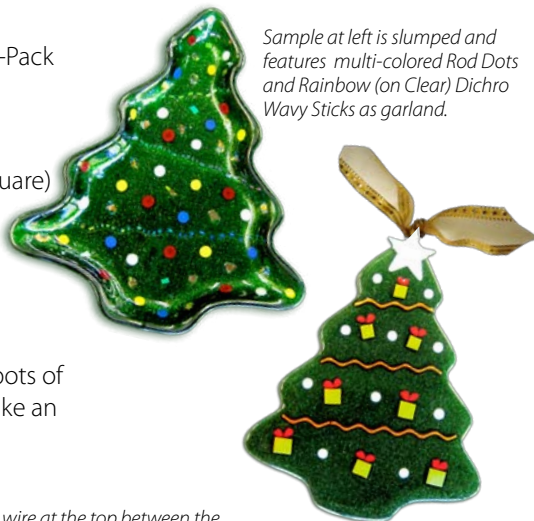
Sample at left is slumped and features multi-colored Rod Dots and Rainbow (on Clear) Dichro Wavy Sticks as garland.